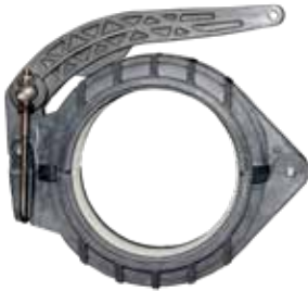
White Nitrile Gasket