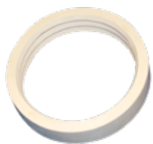
White Nitrile Gasket