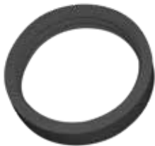
Black Nitrile Gasket