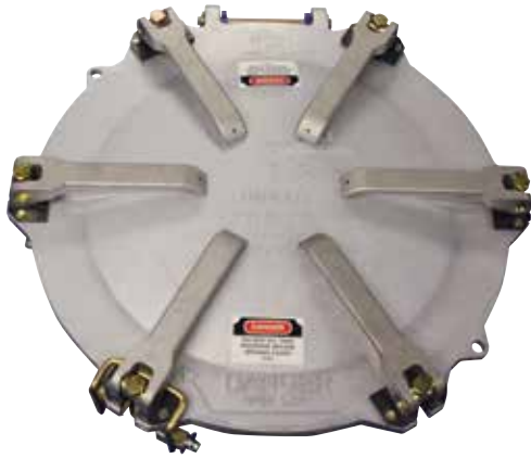
LM 20" Manhole Cover